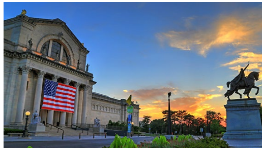
ST. LOUIS, MISSOURI

Get to know the “Gateway City” that was not just America’s doorway to the west, but an optimistic, enterprising hub where many immigrants put down roots. A wealth of fine museums, great dining and a lively musical heritage make St. Louis well worth a closer look.