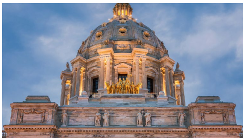
ST. PAUL, MINNESOTA

EXPLORE MORE. More days means more to discover. We offer exciting ways to see even more of the region with extension packages you can add before or after your Viking journey.