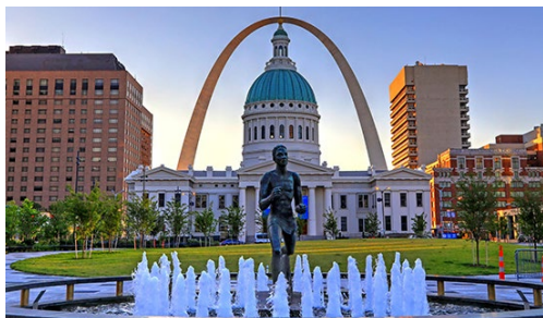
ST. LOUIS, MISSOURI

The “Twin Cities” share a pioneer history and progressive, multicultural spirit—plus a good-natured rivalry and pride in their distinctions. Take more time to gain a full picture of Minnesota’s favorite twins, from Minneapolis’s skyscraping downtown and superb art scene to St. Paul’s leafy grace.