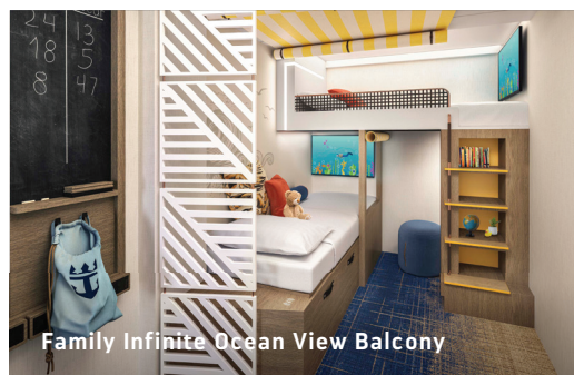
Family Infinite Ocean View Balcony