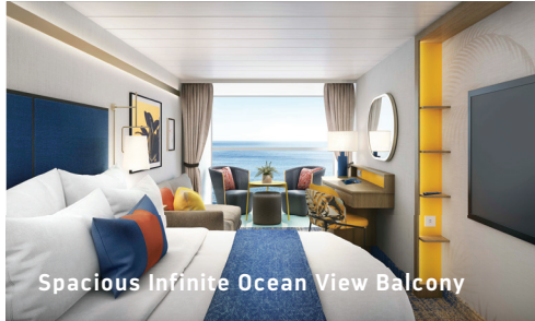
Spacious Infinite Ocean View Balcony

There's no shortage of spectacular ocean views right from your room. In Spacious Infinite Balcony rooms, the expanded living area becomes an oceanfront balcony at the push of a button. Floor-to-ceiling windows in Panoramic Ocean View rooms deliver dazzling sights from the revolutionary AquaDome SM . Or upgrade to the suite life. Panoramic Suites deliver a front row seat to scenery scoping. And the view doesn't get any better than from Sunset Corner Suites, with wrap-around balconies and endless blue in all directions.