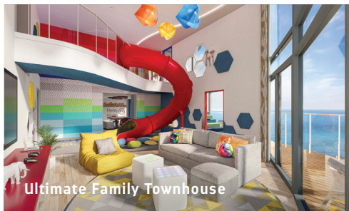
Ultimate Family Townhouse

Finding your crew's just-right space is easy, with rooms specially designed for families. Family Infinite Ocean View Balconies offer separate hideaway bunk room to give kids their own beds, TVs, and space to chill. And Surfside Family Suites are smartly designed to dial up the convenience for everyone — with a spacious split bathroom plus a cozy room for the little ones.