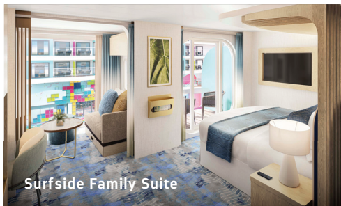
Surfside Family Suite

Innovative Spacious Infinite Balcony rooms put extra room — or a fresh breeze — right at your fingertips with a convertible balcony on-demand. Choose your view and overlook endless blue ocean or the tranquil Central Park ® . Even bigger Family Infinite Ocean View Balcony rooms are a kid's dream, where a separate hideaway bunk room gives them their own beds, TVs, and space to chill.