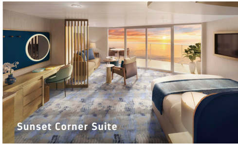
Sunset Corner Suite