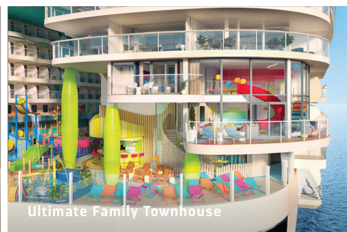
Ultimate Family Townhouse