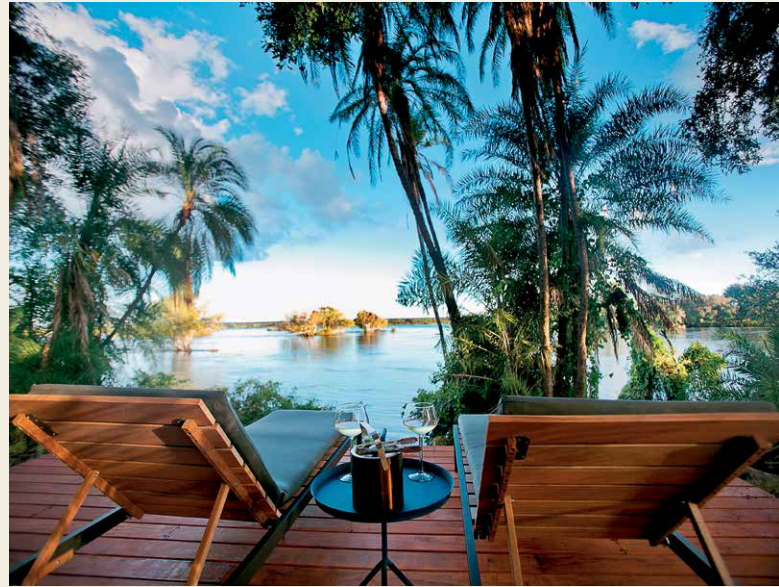
Thorntree River Lodge